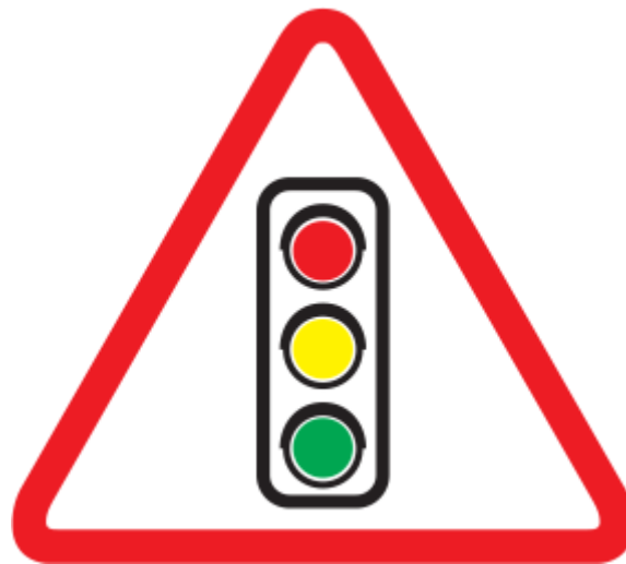
"Regulation of traffic on the road through traffic lights" sign

Where there are traffic lights or traffic controllers, cross the street only on their signal.